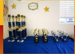
Trophies twinkled in the front of the masjid tantalizingly !