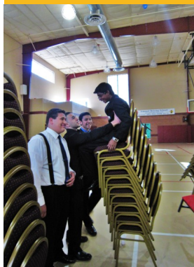
Newly inducted members putting away chairs & having fun!