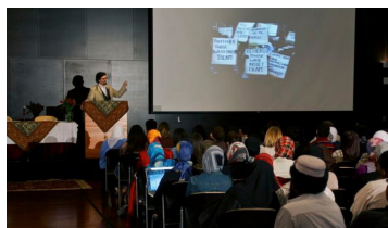
Popular speaker Imam Zaid Shakir, also an American convert

converted to Islam in 1977 and subsequently studied Islam in a traditional style in several venues overseas. He returned to co-found Zaytuna Institute and has been teaching Islam since.